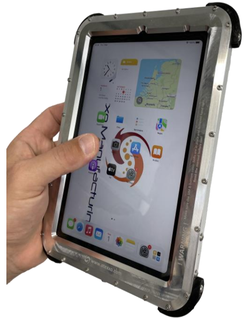
New Slim Bumper Design

ATEX II 2G Ex db IIC T4 Gb / II 2D Ex tb IIIA T135°C Db IECEX Ex db IIC T4 Gb / Ex tb IIIA T135°C Db UKCA Ex db IIC T4 Gb / Ex tb IIIA T135°C Db CSA Class I Zone 1 AEx db IIC T4 Gb CSA Class I, Division 2, Groups A, B, C & D T4 INMETRO On Request